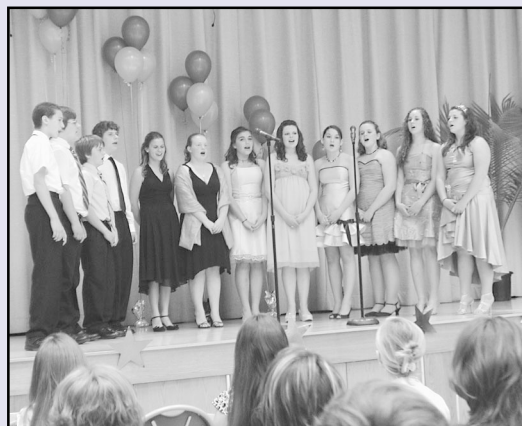
The Middle School Select Choir entertained at the Greyhound Gala.