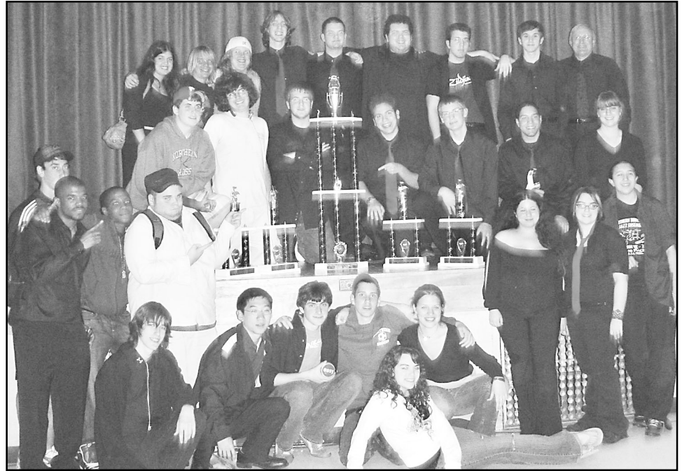
On April 28th, Northern Burlington performed at the NJ-International Association for Jazz Education State Division III Jazz Band Finals at Burlington City High School and took home the gold.

Northern students also came home with trophies for these prizes: Outstanding Trumpet Section, Outstanding Saxophone Section, and Outstanding Sight Reading.