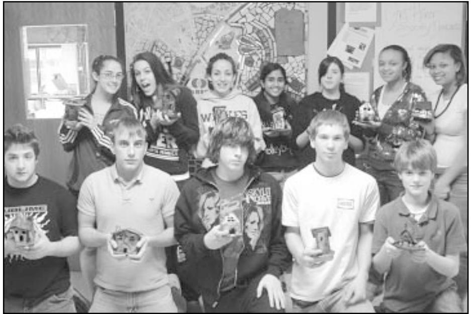
Ceramics I students had a lesson in a very individualized art project.