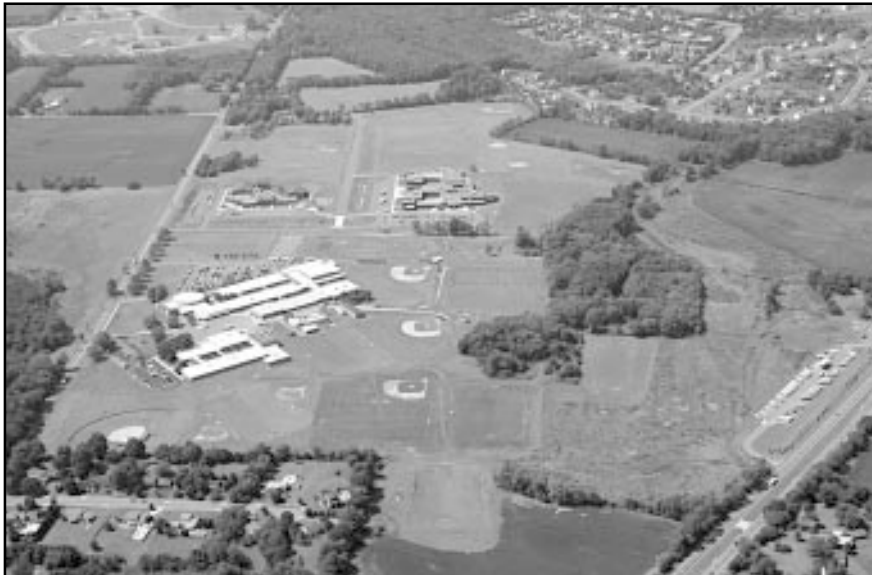
The campus of the Northern Burlington County Regional School District sits on more than 180 acres of land off Route 206 in Columbus.

The end result will be a seven-year improvement plan based upon the district's vision of the future with objectives for reaching that vision.